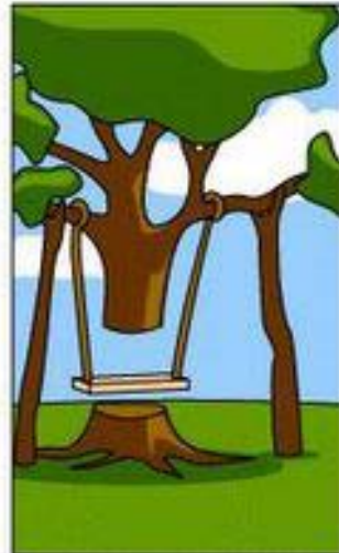
How the Analyst designed it