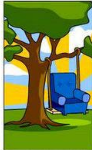
How the Business Consultant described it