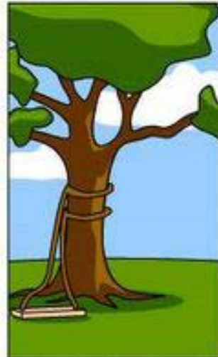
How the Programmer wrote it