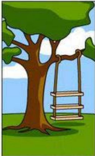
How the customer explained it