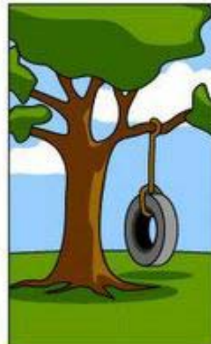
What the customer really needed