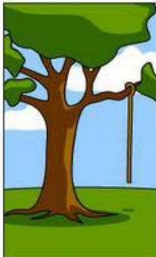
What operations installed