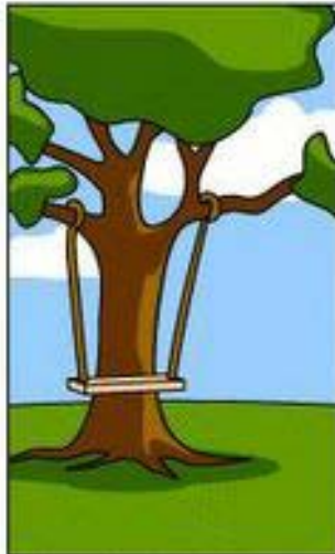
How the Project Leader understood it