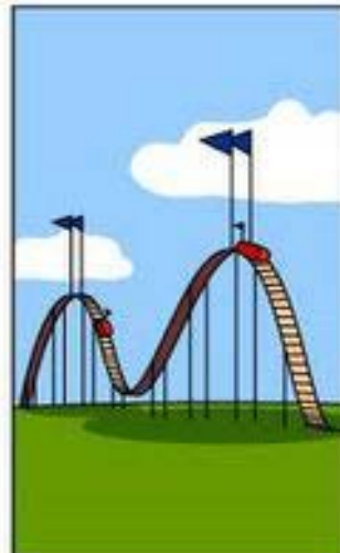
How the customer was billed